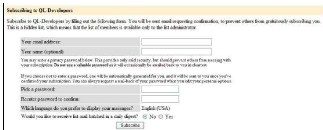
Fig. 2 - The QL-developers list subscription form

http://lists.q-v-d.com/listinfo.cgi/ql-developers-q-v-d.com