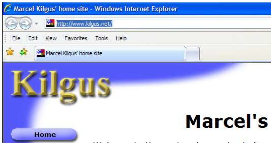
Marcel’s home page, showing the QPC II icon.

You may have noticed that some sites like Marcel Kilgus’s site display a little icon in the address bar of the browser when you visit the page. It can also be displayed in Favourites lists and on the tabs in recent browsers which allow tabbed browsing. As an example, Marcel’s site displays his QPC2 logo (a little QL monitor screen display with QPC II displayed. It can also appear next to the title of a tab in the browser and in the Favourites (bookmarks) list in some browsers.